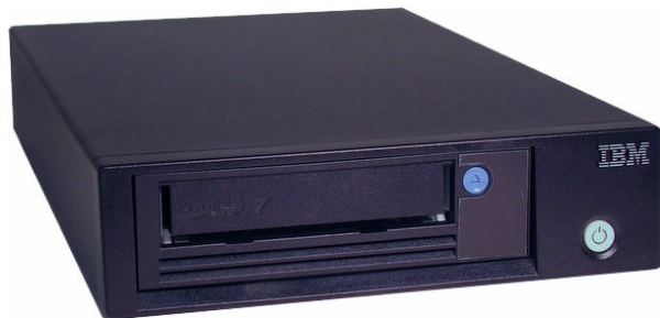
Figure 2. TS2270 Tape Drive for Lenovo

The following figure shows the TS2270 Tape Drive.