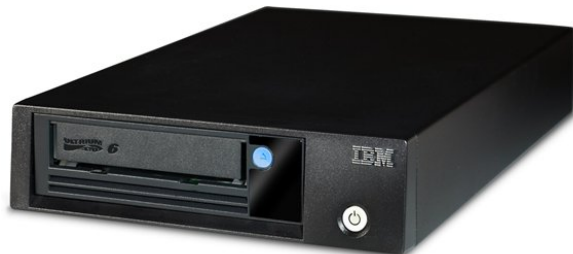
Figure 3. TS2260 Tape Drive for Lenovo

The following figure shows the TS2260 Tape Drive.