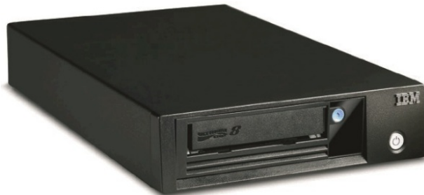
Figure 1. TS2280 Tape Drive for Lenovo

The LTO Ultrium Tape Drives from Lenovo are excellent choices if you use tape drives that require larger-capacity or higher-performance tape backup.